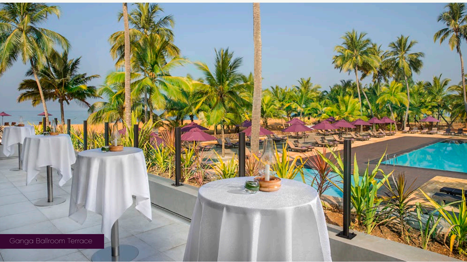
Ganga Ballroom Terrace