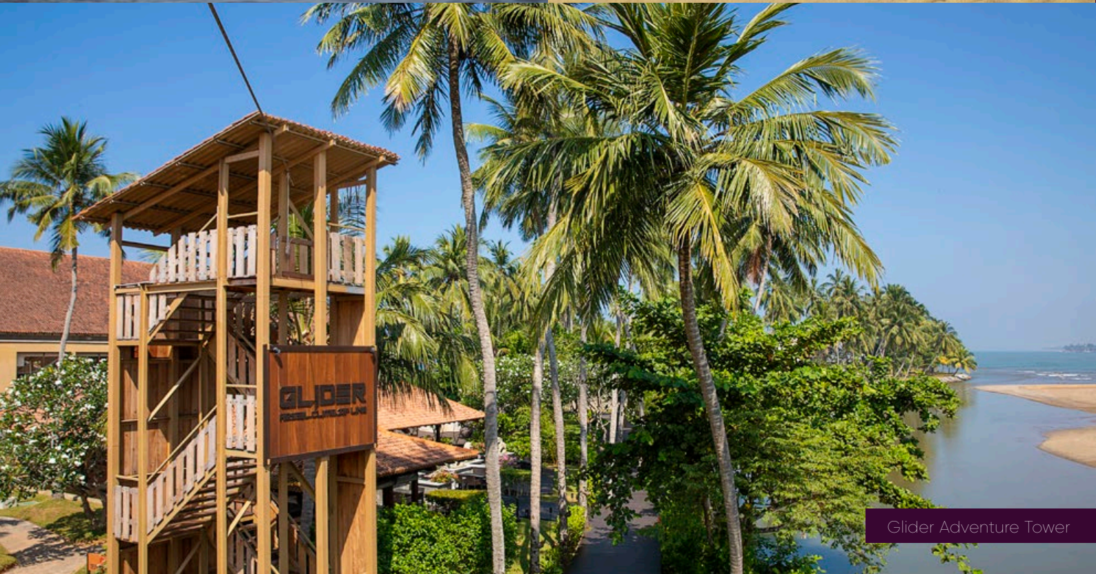
Glider Adventure Tower