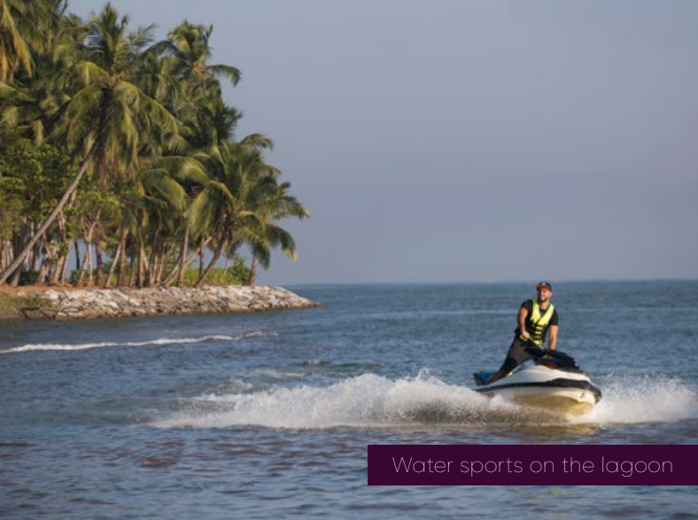
Water sports on the lagoon